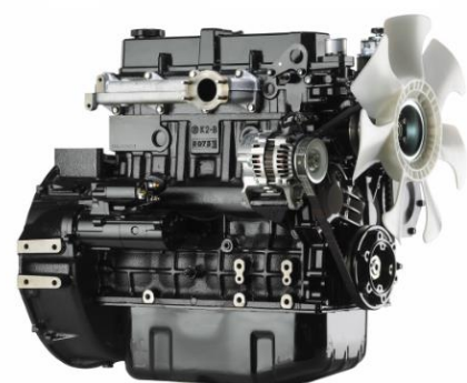
MITSUBISHI S4S (EU111A) 2WD 2-3.5Ton

Rated output 35.3kw/2250rpm Rated Torque 182N.m/1800rpm