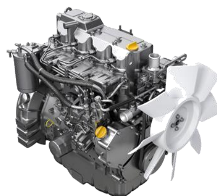
YANMAR 4TNU94L (EU111A) 2WD/4WD 2-3.5Ton

Rated output 35.3kw/2250rpm Rated Torque 182N.m/1800rpm