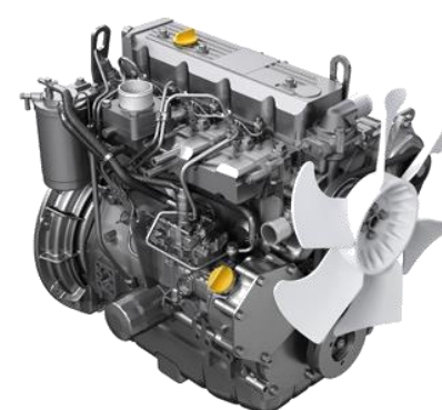
YANMAR 4TNE98 (EU111A) 2WD/4WD 2-3.5Ton

Rated output 35.5kw/2400rpm Rated Torque 191N.m/1200rpm